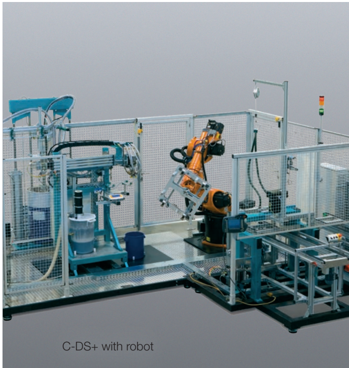
C-DS+ with robot