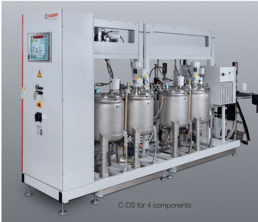
C-DS for 4 components

Flexible and compact for all dispensing requirements