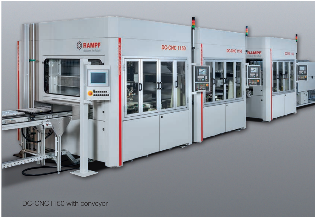
DC-CNC1150 with conveyor

Compact and flexible - the big-time compact dispensing cell for secure sealing, bonding, and potting using up to four components