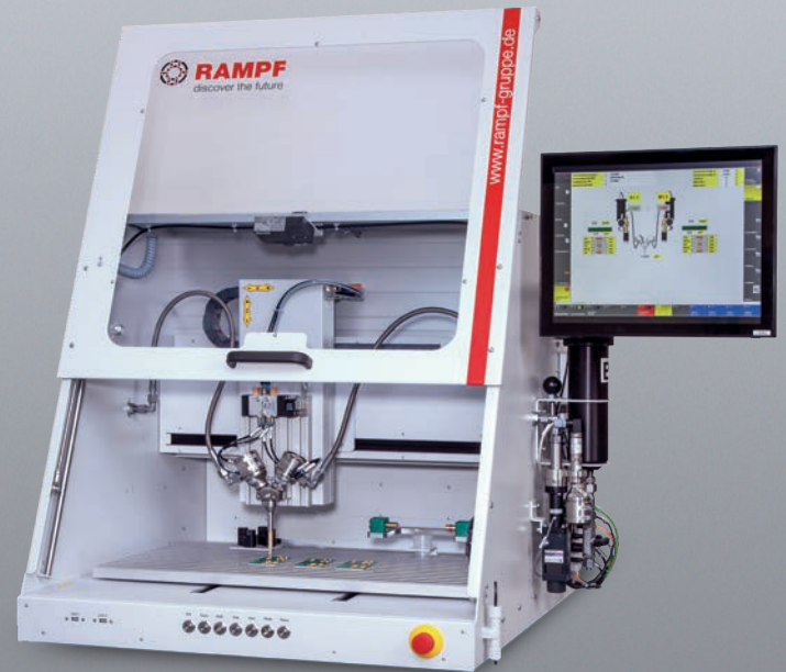
The desktop design allows a flexible arrangement within your production process