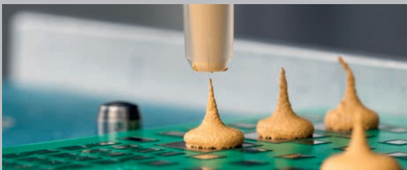
Reproducible dispensing of abrasive material

This ensures maximum precision and extended service life during the service intervals. Compatible with all common static miscible greases, adhesives, and resins. To ensure a safe production the machine is equipped with nozzle check.