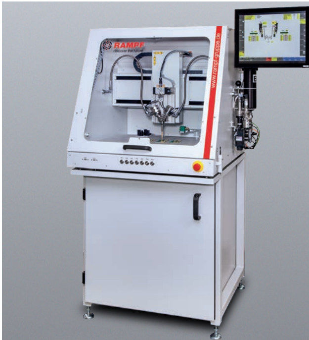
Slim design, multiple choices for dispensing of thermal greases, resins, and adhesives

Compact and flexible - the new desktop cell for high-precision dispensing of abrasive materials